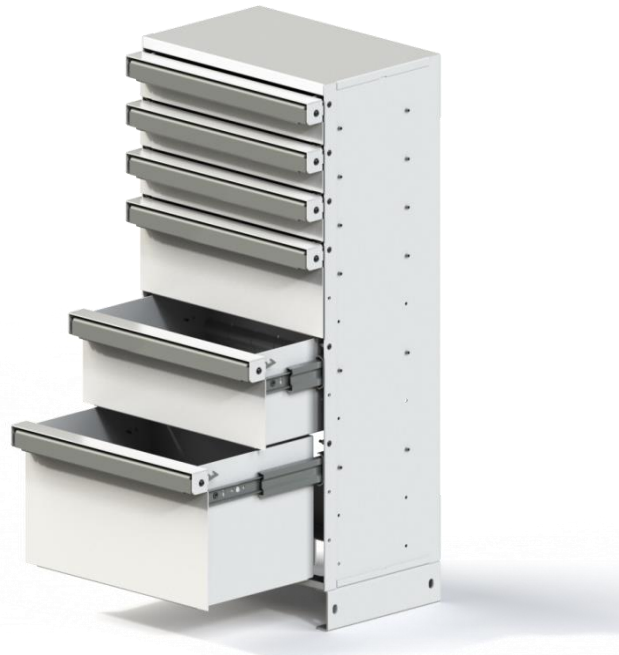
Product shown: BDS24N321